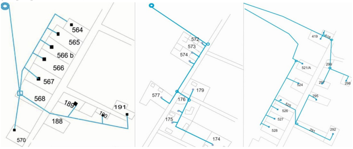
Legend: = roads, 189 number, ○ spring,— pipe, ■ external water tap

Best practices of water supply communities include that of the Bor brook community of the Jenőfalva tenth and the water community provision community of the Hiászó brook whose water pipe system demonstrating rational management practices was installed in the spring of 2005. Other examples entail the water supply community from the Sás-kert area of the Háromtízes (Three-tenth) groupand that of the Monyasd brook established in 2002. Based upon the information obtained at the premises the schematic outline of said communities prepared by two student members of our research group is presented in Figure 2 .